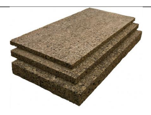
Illustration of the product:

Expanded Insulation Corkboard (ICB), with an average density of 115 kg/m<sup>3</sup>.